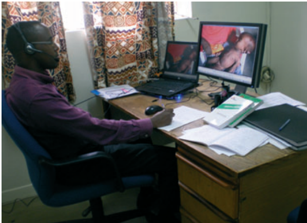
Figure 1 Consultation room and specialist paediatrician in Nairobi, Kenya conducting a telemedicine consultation with colleagues in Guri'el hospital, Somalia.

who spoke the Somali local language to counsel parents of very ill children, thereby fostering a positive relationship between the clinical team and parents. Paediatric management was in line with WHO and MSF clinical guidelines (MSF 2010).